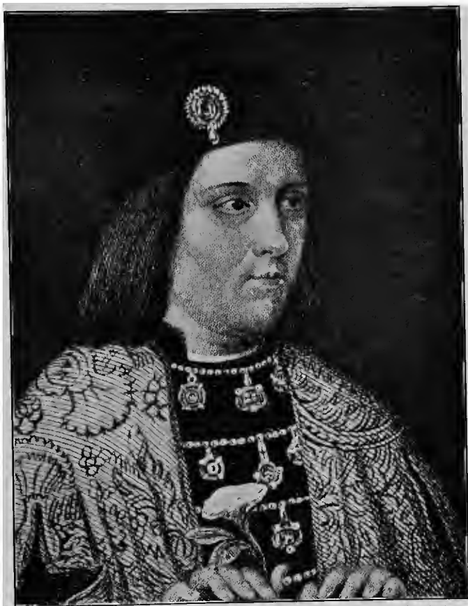
EDWARD IV AS A YOUNG MAN